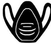
Protective Clothing Pictograms